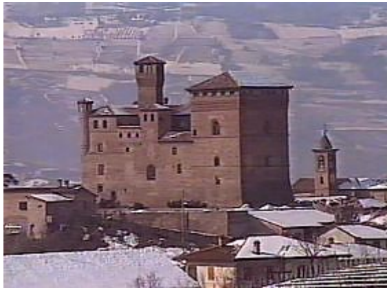
GRINZANE CAVOUR CASTLE