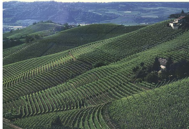
HILLS PLANTED WITH VINEYARDS